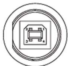
Pin Assignments Front View